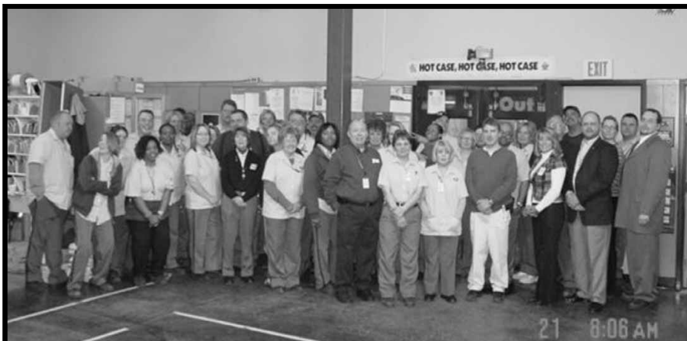
Congratulations Plymouth Post Office. The carriers received a recognition breakfast for the Customer Connect Program. When asked how they achieved the number one status, they replied: "TEAMWORK".