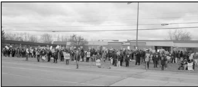
1000 Strong at the Southfield Post Office